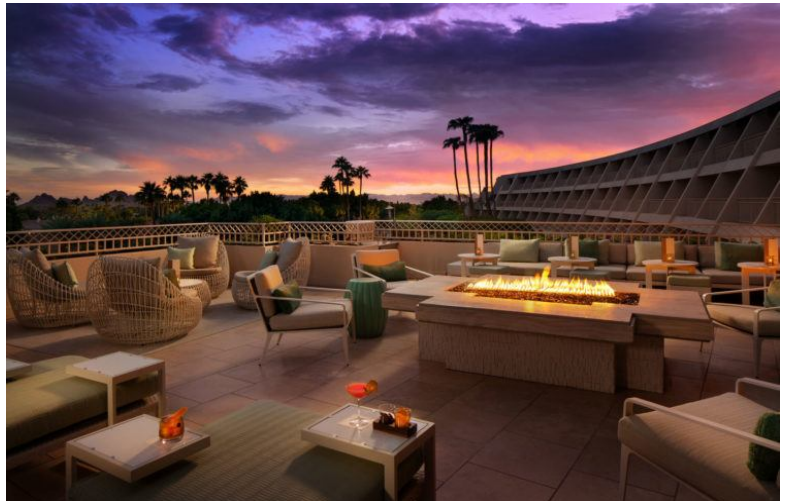
Outside patio, Thirsty Camel at The Phoenician, a Luxury Collection Resort

Email: denise.seomin@luxurycollection.com