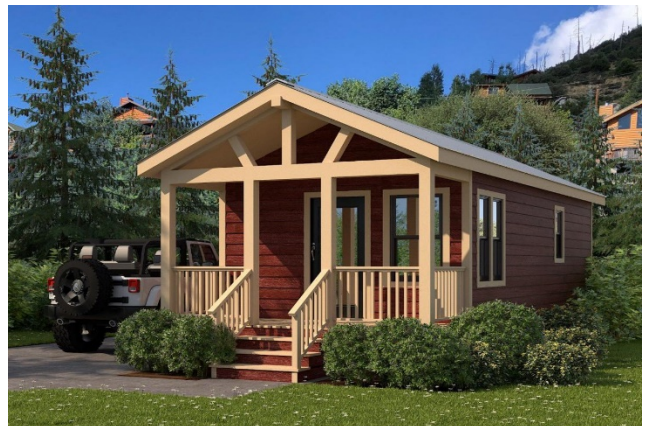
Casita digital design, Mt. Lemmon Hotel