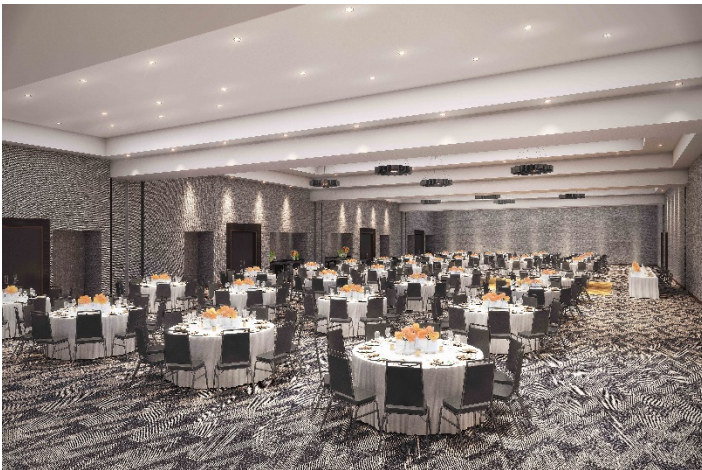
Ballroom, Marriott Hotel Phoenix Chandler