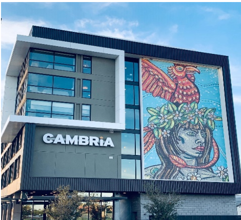
Exterior, Cambria Downtown Phoenix Hotel

The new Cambria hotel , located in the Roosevelt Row Arts District in downtown Phoenix, features seven stories with 127 guest rooms, an outdoor pool, a fitness center, a new restaurant, and a rooftop bar. The Cambria's new hotel restaurant, Poppy , is open to hotel guests and the general public. The menu, created by executive chef Nate Cayer, is comprised of globally inspired dishes and shareable plates. Cayer is sourcing produce through local vendors, such as Chula Seafood, The Fig and The Knife, Beetanical Garden, Noble Bread, and Sterling Meats.