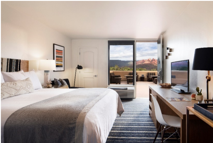
Guest room, Sky Rock Hotel