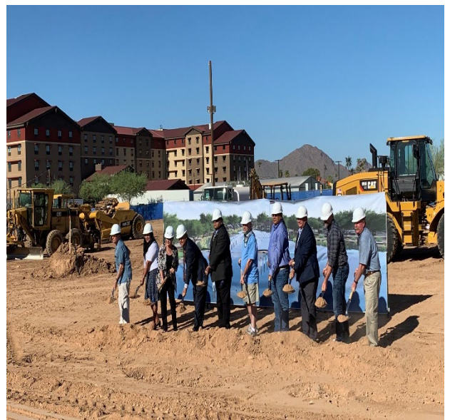
USS Arizona Memorial Gardens, Salt River Pima-Maricopa Indian Community