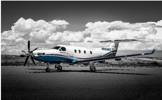
Pilatus PC-12 turboprop aircraft, Vernon Aviation

Vernon Aviation announced the opening of its newest base of operations at Scottsdale airport . The luxurious and cost effective, Pilatus PC-12 turboprop aircraft can accommodate up to 8 passengers. This location is the second base for Vernon Aviation, with its first being located in Farmington, NM.