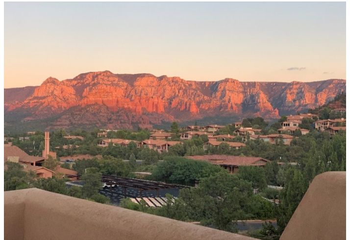
Balcony view, Sky Rock Hotel