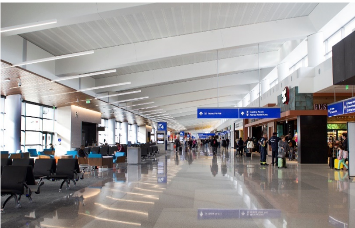
South Concourse, Terminal 3, Phoenix Sky Harbor Airport