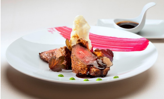
Elk Loin, Kai

La Liste 2020 , a prestigious global restaurant-ranking system from France that celebrates the top 1000 dining experiences in the world, included Kai Restaurant . La Liste is based on an algorithm that analyzes restaurant reviews from around the world and consumer ratings for more than 20,000 restaurants. Kai Restaurant, at the Sheraton Grand at Wild Horse Pass in Phoenix, is the only restaurant in Arizona to receive the honor.