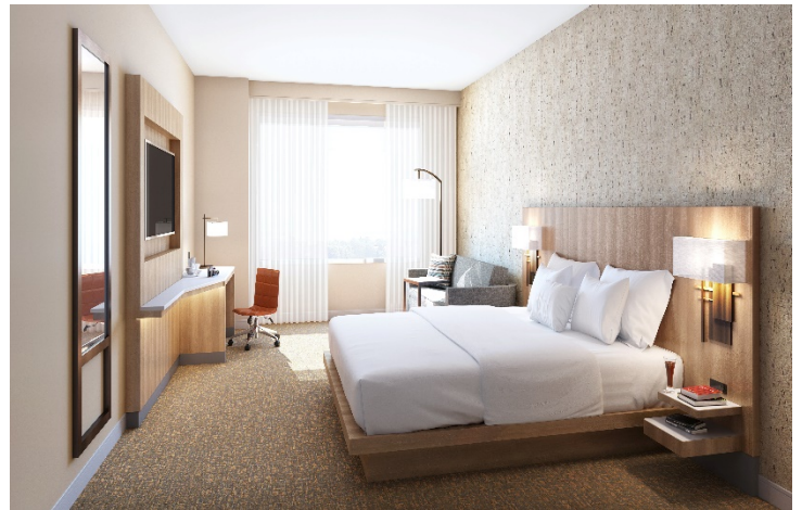
Guest room, Marriott Hotel Phoenix Chandler