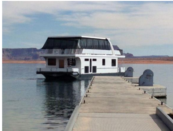
Lake Powell Resort's Wanderer

Lake Powell Resorts & Marinas has announced the newest addition to its fleet of houseboats – the Wanderer . The Wanderers are 59-ft. long and 18-ft. wide, two full feet wider than most four bedroom boats, with four queen-sized staterooms, two bathrooms, a screened upper deck driving helm that includes a wet bar and a barbeque. The top deck includes convertible dinettes, a 48-inch LED TV with Blu-ray players and an enclosed water park-inspired spiral tube slide. The Wanderer is built for Lake Powell with a reverse design, placing living areas in the aft section maximizing views of the scenery from all living areas and allowing for greater privacy in the bedrooms. The Wanderer accommodates up to 12 passengers. In addition, Lake Powell Resorts and Marinas offers rentals ranging from powerboats, to water toys that include ski tubes, wakeboards, kayaks, water skis, paddle boards, and kneeboards. The six new custom-built Wanderer houseboats, are available for rental in June.