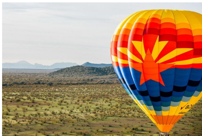
Rainbow Ryder's Arizona Rising

To celebrate the State of Arizona's 105th birthday, Rainbow Ryders Hot Air Balloon Ride Company , gave the state a one-of-a-kind gift – a new Arizona themed hot air balloon. The new hot air balloon named Arizona Rising , joins its sister hot air balloon, Valley of the Sun , a balloon which was purchased to celebrate the state's 100th birthday. The Arizona Rising hot air balloon joins the 25 hot air balloon fleet used to promote Arizona tourism and bucket list adventures throughout the Valley of the Sun and travels to other cities for special events. In Phoenix, the weather allows for year-round flights, allowing visitors the chance to see the valley from the air throughout every season with either a sunrise ride, sunset ride, a gourmet breakfast or dinner ride or a private ride. In addition to the new balloon, Rainbow Ryders opened a new 12,000 square foot Adventure Center and office at 715 E. Covey Lane near the Phoenix Deer Valley Airport.