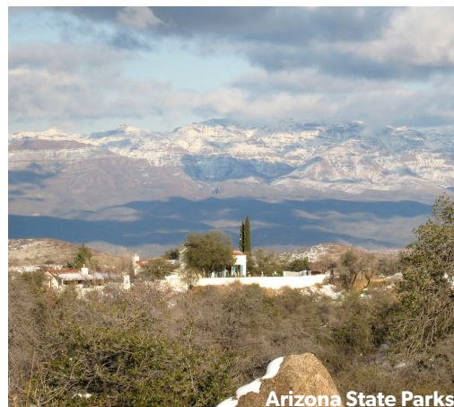
Arizona State Parks